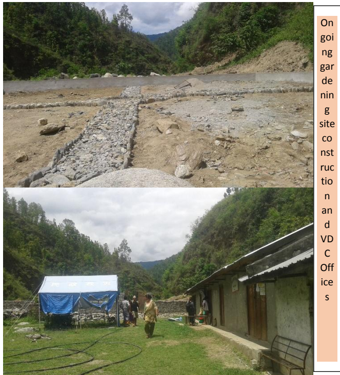
On going garden site construction and VDC Offices

We interacted with LDO, DGE, Account Officer, Information Section Chief, Monitoring and Evaluation Officer and ICT Volunteers in Sindhuli DDC Office. It was noted that almost 90% planned activities of the DDC were in completion stage. Out of total Rs. 90, 20000 planned for DDC activities, Rs. 13,15,164 was spent in various activities. Of the total expended, Rs. 625000 was spent in earthquake impacted communities.