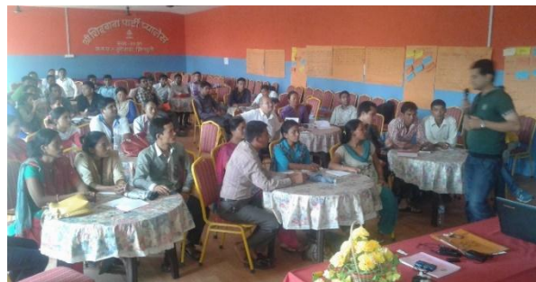
Training on CFLG to Social Mobilisers and VDC Secretaries