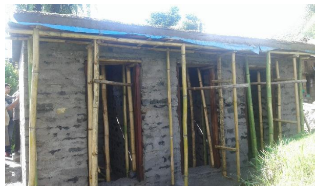
Public toilet, under construction