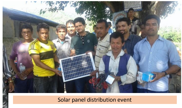
Solar panel distribution event