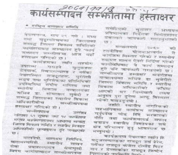
FIGURE 3: MEDIA COVERAGE-NEPALGUNJ PERFORMANCE CONTRACT SIGNING PUBLISHED IN GORKHAPATRA NATIONAL DAILY

29 Magh 2071, Nepalgunj, Gorkhapatra National Daily.