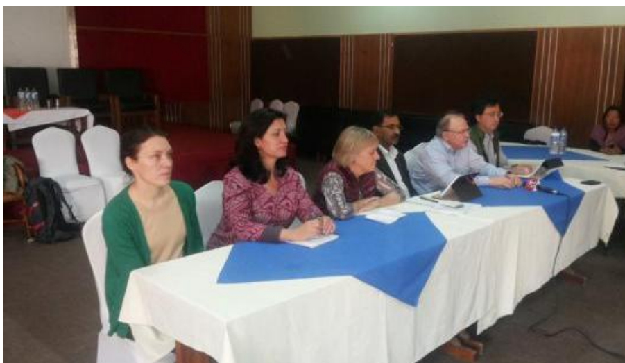
FIGURE 5: MOFALD OFFICIALS AND DPS DURING THE PRES CONFERENCE

LGCDP Regional Coordination Unit Nepalgunj, organized a press conference after the field visits. Their Excellencies Ambassador of Switzerland, Norway, and Denmark along with the other high dignitaries' were