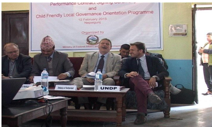
FIGURE 2: HIGH LEVEL DONOR REPRESENTATIVES DURING THE CEREMONY

Addressing the ceremony, the Secretary highlighted that Government of Nepal is committed to deliver prompt quality goods and services to the citizens. He further stressed that the local governance process can be strengthened only if the citizens are empowered and enabled to actively participate in the local level decision making process. The absence of elected local bodies has been a complex environment to make the LBs more accountable and responsive to citizens. Despite many efforts, the resource allocation could not prove equitable as expected. To address and minimize such complexities, MoFALD introduced various measures like formulae based grant system, Minimum Conditions and Performance Measurements (MCPMs), developed and revised resource mobilization and management guideline, introduced transformational approach to social mobilization, capacity development of service providers and promoting e-