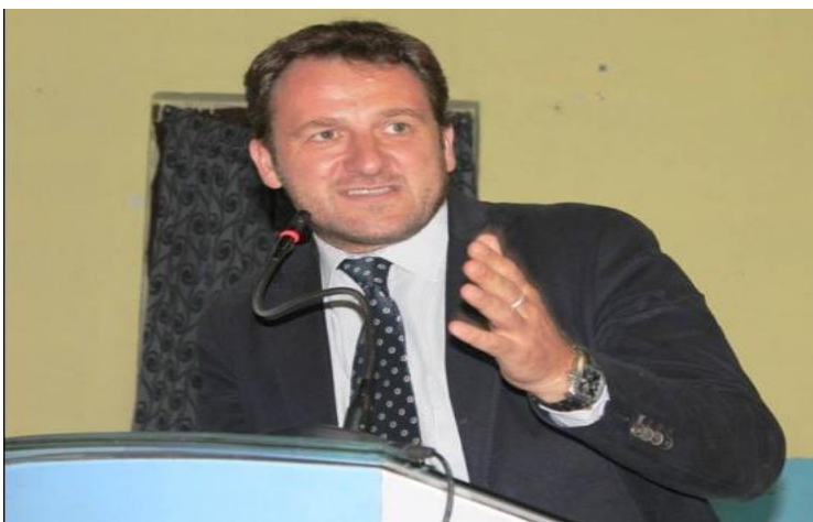
FIGURE 4: UNDP REPRESENTATIVE DURING CLOSING REMARK

At the end of the session, all the distinguish excellence ambassadors and delegates expressed their views regarding the performance contract signing ceremony. Many of them praised the initiative as an important step towards making local government more accountable to its communities.