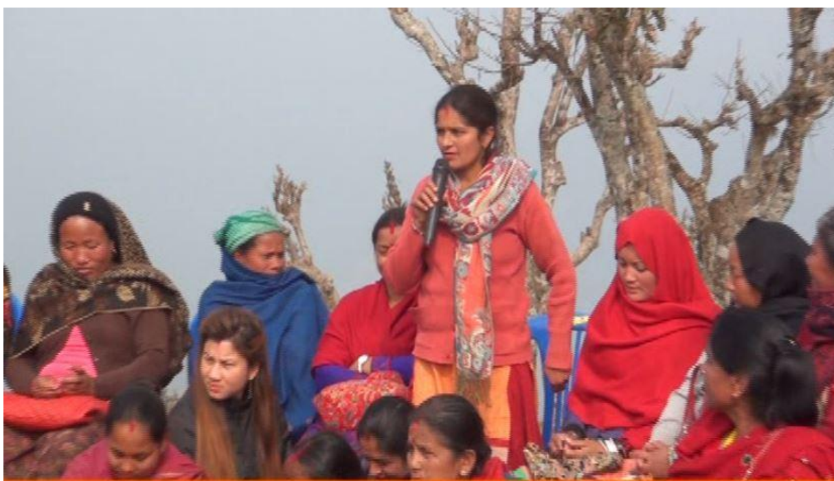
A participant raising question at a Public Hearing event held in Manapang VDC Tanahun