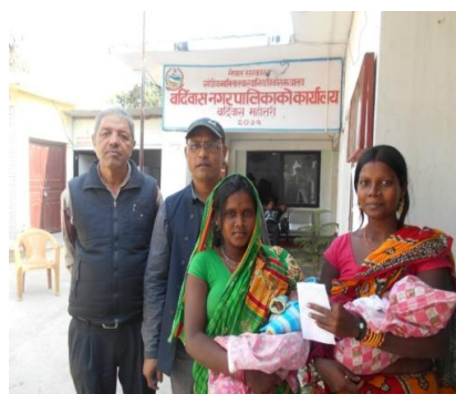
Birth registration within 35 days by Musahar family

program, mobilized social mobilizers and Citizen Awareness Centre to activate the ReFLECT classes. Parallel to this, other local social leaders, media, political parties worked their way for the improvement of the living condition of the Musahar community. Now, the water and sanitation situation are improved, cases of vital event registration even among the Dalit community have increased. Recently, Dhurmus-Suntali Foundation announced that it was constructing the houses for 50 Musahar households in this settlement. The municipality is also planning to contribute some amount of money to the foundation's work.